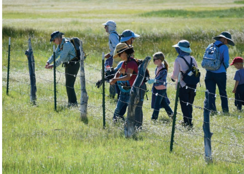
Volunteers mark a pasture fence to reduce sage-grouse fence-strikes in the RCPP project area on a preserve owned by Eastern Sierra Land Trust. The simple fence tags reduce sage-grouse mortality by 80%.