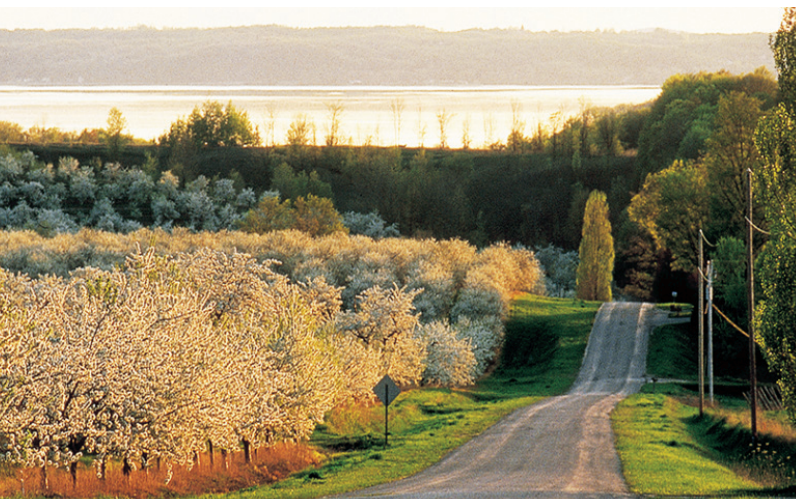
Leelanau Conservancy has been a consistent voice for farmland protection in Michigan’s fruit belt.

Additionally, working with Michigan State University Extension, Farm Transitions aims to encourage working farmers to plan for the succession of their farm to the next generation. With technical assistance from the extension and area succession-planning professionals,