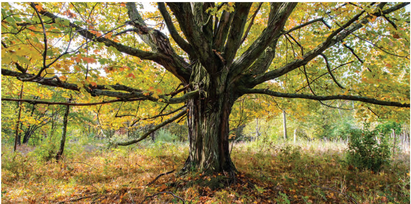
Ancient maple tree at Lighthouse West Natural Area.