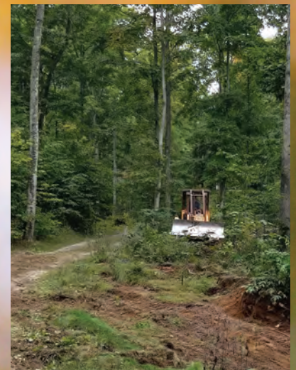
Clearing a path for deer enclosure fencing at Palmer Woods Forest Reserve.