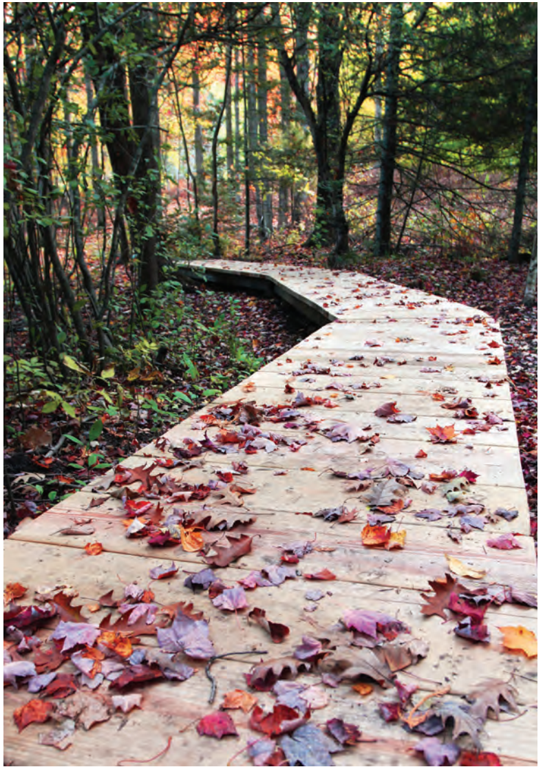
This new boardwalk at Swanson Preserve is one of two built this summer.