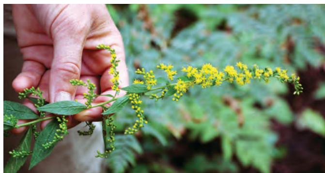
One of the many species of goldenrod found at the Soper Preserve.