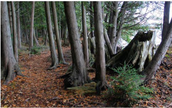
The new Lake Shore Loop at Swanson Preserve.

New trails were also opened and marked at Palmer Woods Forest Reserve, and more are in the works! (Story opposite page.)