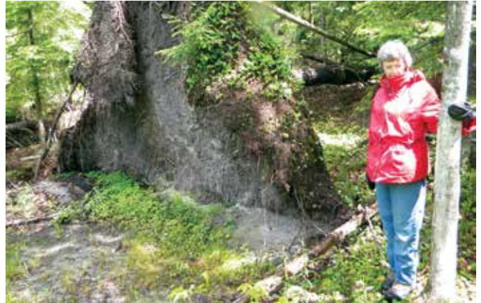
Shallow-rooted cedars overturned by the wind at the Jeff Lamont Preserve, seen on a spring time docent-led hike last year.