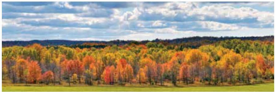
The iconic Oleson Farm in the Bohemian Valley was preserved by the Campaign in two separate projects totaling 268 acres. Sandhill cranes flock to this property in the spring, and the lands protected include working farmland as well as forest.