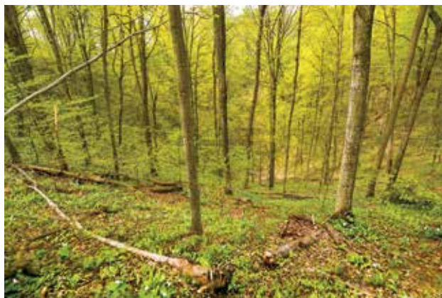
The Noonan Family Kettlehole property is a geologic wonder. This 200-acre private land conservation easement in Kasson Twp. was donated along with a second 306-acre conservation easement on Polack Lake. The combined project set the record for the largest CE project in our history at 506 acres.