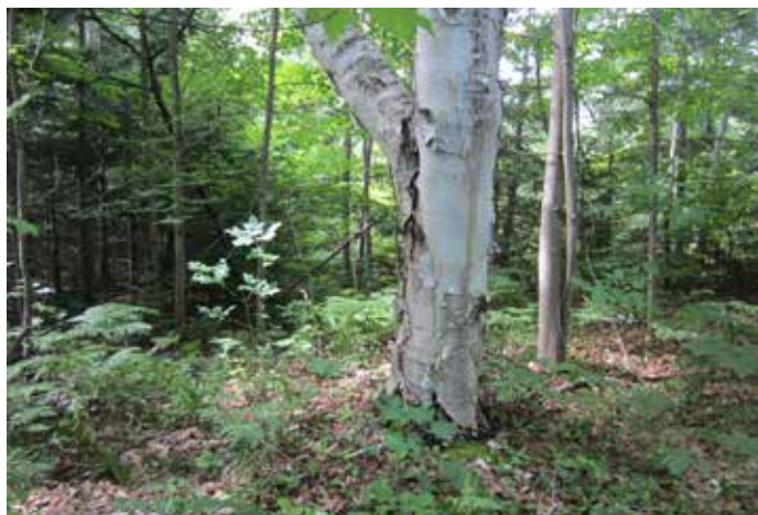
The 30-acre land donation protects 3,200 feet of stream frontage along fragile Houdek Creek at the Houdek Dunes Natural Area.