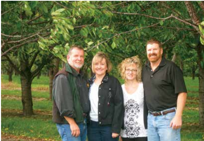
The Send-Emeott families preserved 145 acres of prime fruit-growing farmland in Bingham Township with the help of the Campaign.