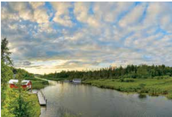
A third addition to the Lake Leelanau Narrows completed during the Campaign protects this sensitive wetland complex which is a haven for fish, wildlife and plants that keep Lake Leelanau pristine.