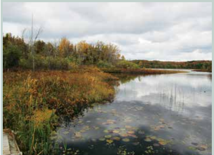
A significant part of Bass Lake shoreline—over a half mile—has been preserved with a conservation easement.

The Conservancy, supported by our West Grand Traverse Bay Protection Grant from the MDEQ, has purchased a conservation easement on 89 acres of beautiful and ecologically significant land that forms the headwaters of Belanger Creek on Bass Lake near Omena. The landowner, who wishes to remain anonymous, has generously donated a portion of the conservation easement value to help the Conservancy meet the MDEQ's grant match requirements. The project protects over 3,100 feet of undeveloped shoreline, a mature hardwood forest stand, 22 acres of wetland and over 1,000 feet of stream frontage on Belanger Creek. This conservation easement will maintain critical fish and wildlife habitat and connects to a natural greenway along the Belanger Creek valley. The project is also located near other protected lands, creating a significant conservation corridor.