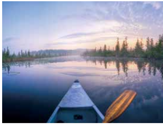
Three wetland projects funded by the Campaign expanded the beautiful Cedar River Preserve by 220 acres—helping to ensure the pristine nature of Lake Leelanau.