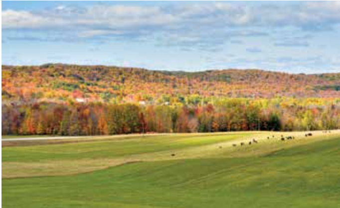
The Oleson Farm in Bohemian Valley along Co. Rd. 669