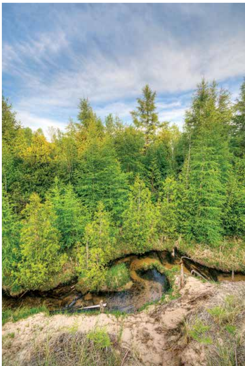
Houdek Creek, which can be seen from an observation deck at Houdek Dunes Natural Area. This natural area expanded by 37 acres during the Leelanau Forever Campaign, with three separate projects that protect this fragile creek, which flows into Lake Leelanau.

to our permanent endowment provide income to support our mission. Such steady, predictable funding streams are critical to our success, helping to smooth bumps in the economy and supplement operational or land protection funding needs. Supporting the Endowment Fund is a permanent, lasting way to provide on-going and essential support to conserve the land, water and scenic character of Leelanau County.