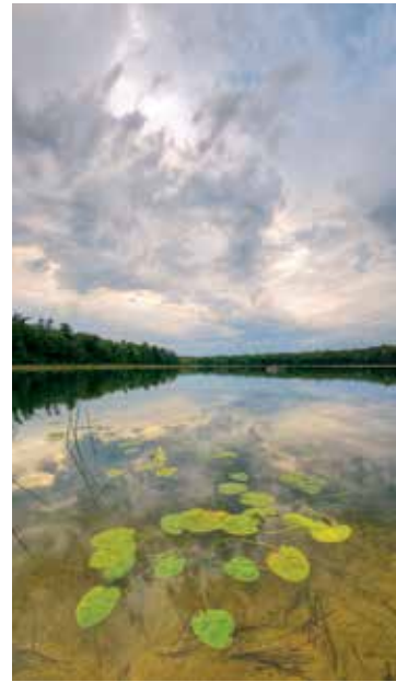
During the Campaign, Kehl Lake Natural Area expanded by 52 acres—the 5 th addition since this lovely natural area was created in 1992.