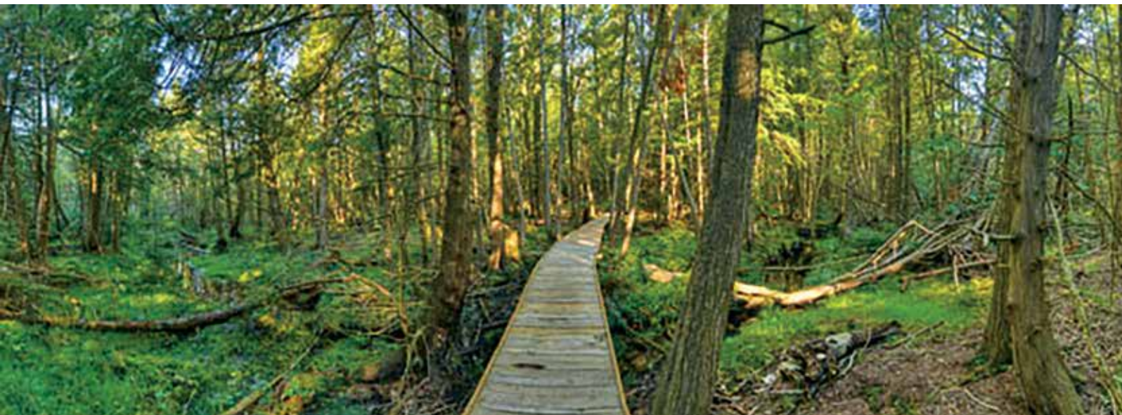
The boardwalk through Swanson Preserve, one of the signature projects of the Leelanau Forever Campaign.

I was privileged to serve as a Board member of the Leelanau Conservancy for six years and as Treasurer for part of that time. I saw up close the skill of the Staff and Board, and the time, talent and energy employed in determining the preservation priorities the Leelanau Conservancy should pursue in coming years. When we were asked to consider donating to the "Leelanau Forever" Campaign we were quick to designate our contribution to the "Where Most Needed" category because we know the current and future Boards and staff are best equipped to determine where funds are best used. Because circumstances change over time we believe the Board must have the flexibility to make funding choices based on current facts and we trust them to do so very effectively.