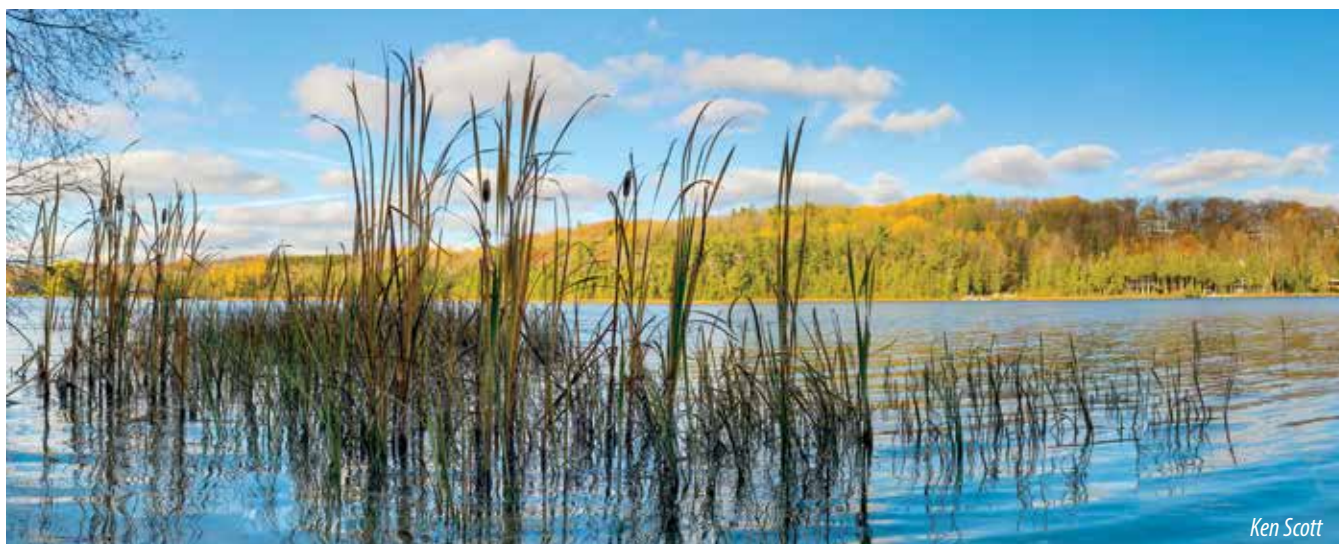
The DeYoung Natural Area on Cedar Lake protects nearly one mile of shoreline.