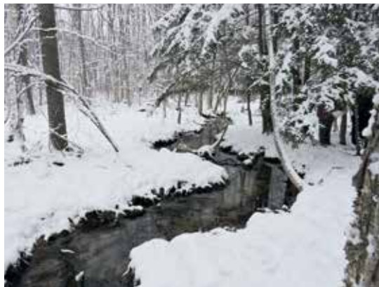
The Campaign funded the creation of three new natural areas for the public to enjoy, including Hatlem Creek Preserve, home to a rare marl spring. The fragile Hatlem Creek area includes habitat for the endangered Michigan monkey flower, and the creek is the prime tributary to Glen Lake.