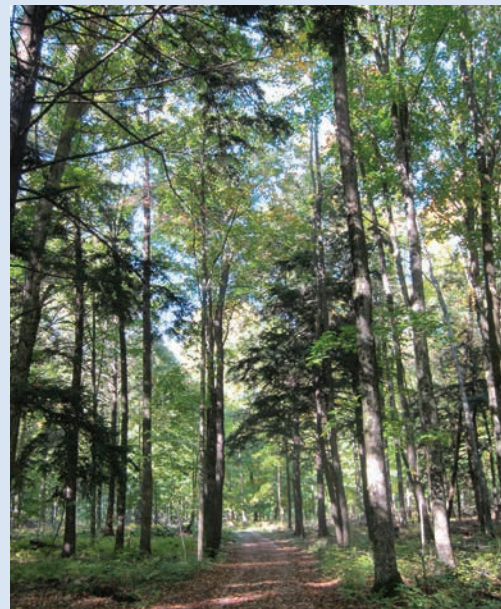
A sunlit path through hemlock trees at Palmer Woods

"We realize that Palmer Woods comes on the heels of our four-year capital campaign, which protected Clay