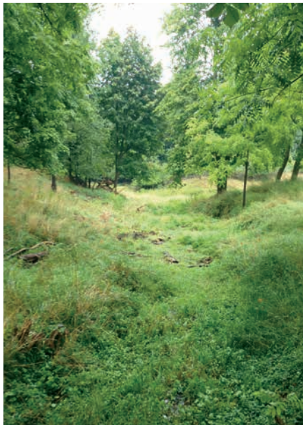
The stream on the Weese Property empties into nearby South Bar Lake