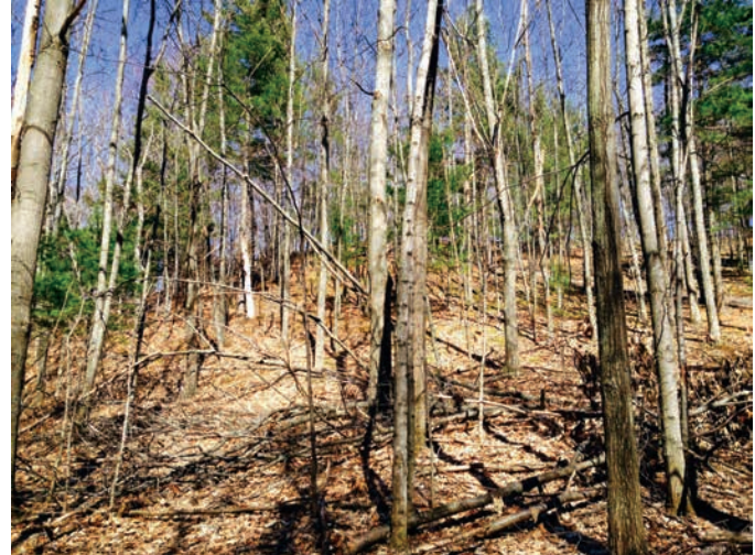
Steep slopes and valleys at Palmer Woods were formed by glaciers

over decades will remain and endure with the help of the Leelanau Conservancy."