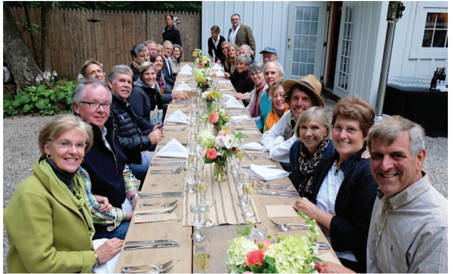
Epicure Catering and Cherry basket Farm is again offering a fantastic auction item - see our bidding website for more details