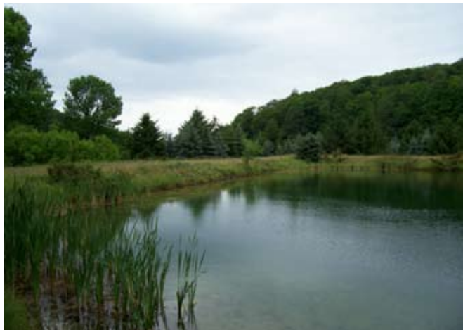
A spring-fed pond provides wildlife habitat