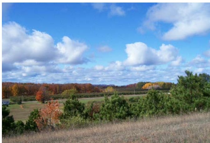
Views from Good Harbor Trail, now & forever, thanks to the Kuhns.

(The Kuhn's 35-acre farm in Centerville Township is off Good Harbor Trail. The property includes about seven acres of mixed hardwood and conifer forest near its eastern edge, which provides important habitat for wildlife and helps facilitate wildlife movement across the nearby agricultural landscape. There is a prominent ridge, which on a clear day you can see Lake Michigan, and much of the property consists of rolling hills, open fields and vineyard. This property is considered important agricultural land as stated in the Centerville Township's Master Plan, and has a long history of productive farming.)