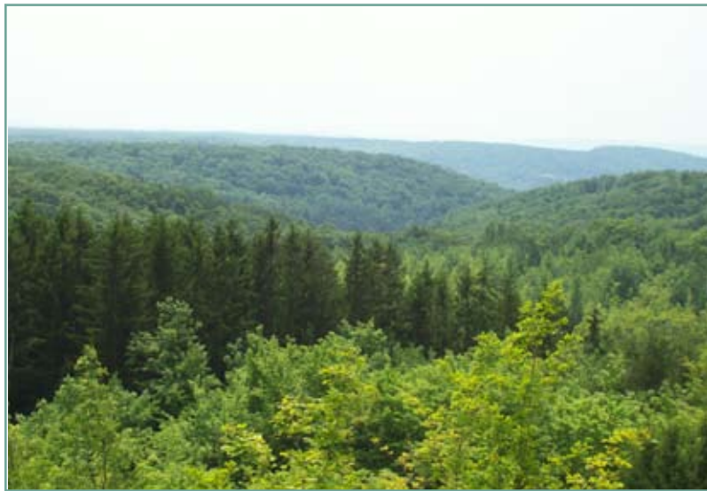
You can see for miles and miles: 285-acre conservation easement will help protect this view.