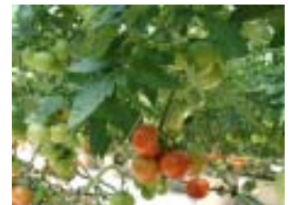
Cherry tomatoes from TLC Tomatoes—which also promotes local foods through its own dinner series near Suttons Bay—are on our menu.

There you have it—just a few tidbits about what it takes to grow the food we all enjoy. We plan to post more stories and photos on our website: www.theconservancy.com . Hope to see you at the Picnic, where you'll be sure to taste the local difference!