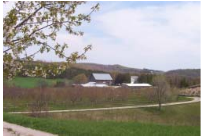
The Gary Bardenhagen Farm near Lake Leelanau

Of the 240,500 surface acres of land/water in Leelanau County, only about one-sixth of it, approximately 40,000 acres, is still being farmed in the 21 st century. With the intense development and economic pressures facing family farmers, how many farms will survive to 2010 or 2020? In a little over a generation, many American communities have lost most or all of their prime farmland. In Leelanau, our two primary economic engines are tourism and agriculture. Together they form the backbone of our