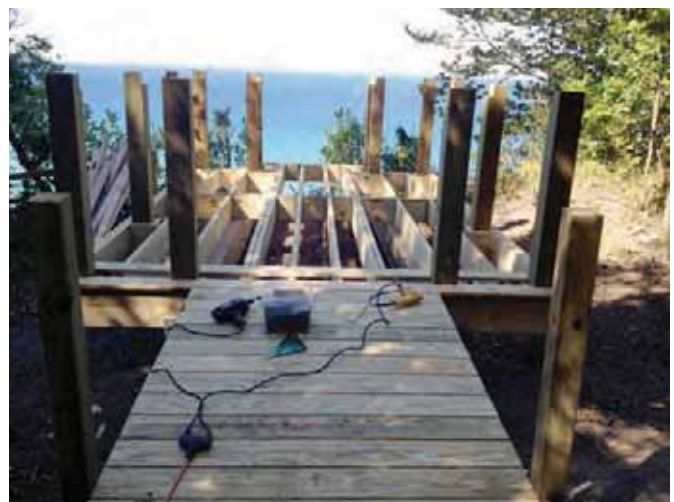
Clay Cliffs observation platform in progress