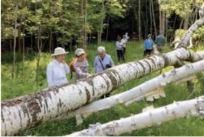
Enormous fallen birches at Hatlem Creek Preserve

Rare marl springs, enormous birch trees, and a glimpse of the endangered Michigan Monkey Flower are just a few of the