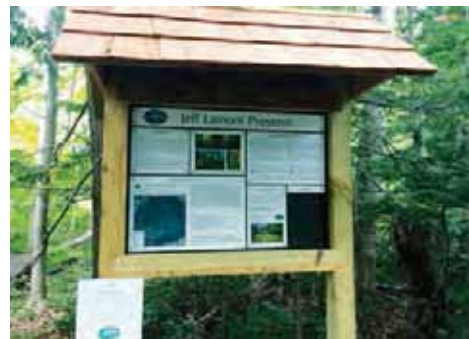
Our kiosks got a makeover this summer! Check out the new information and watch for updates.

Please note: No workbees are currently planned for the winter. Please visit our website or contact Sarah Cook for information on future workbees: scook@leelanau-conservancy.org or call 231-256-9665.