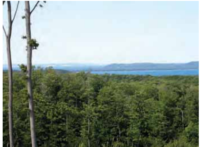
The beautiful land along Echo Valley Road awaits a conservation buyer

In some cases, the Conservancy will purchase land with important ecological features and hold it until a conservation buyer can be found. The property will then be sold at fair