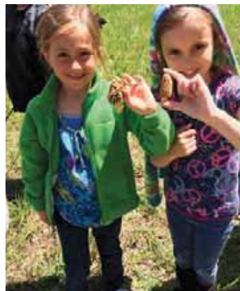
Second graders from Glen Lake found morels while looking for spring plants and animals at Chippewa Run Natural Area.