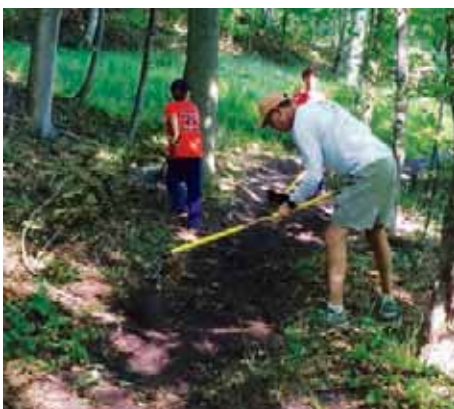
The Redfields returned for a second summer of trail work at Clay Cliffs NA.