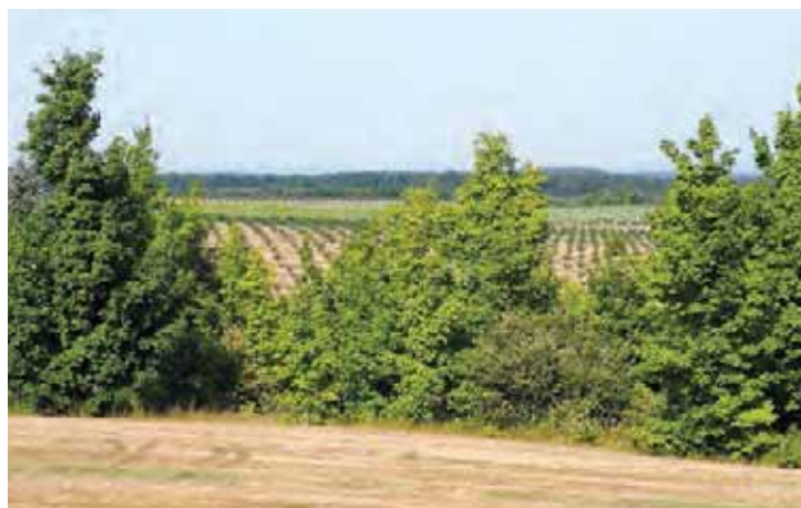
2014 Annual Picnic - View from Top of the World