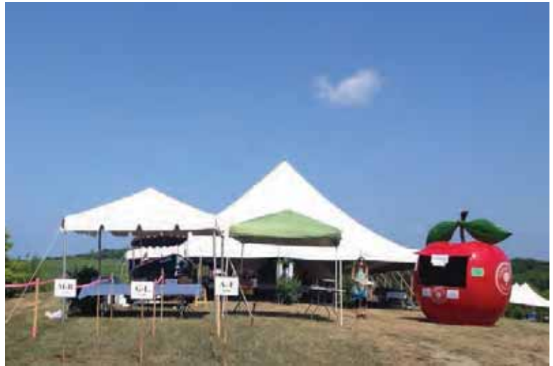
Waiting for 850 attendees!

Putting on an event of this magnitude doesn't happen without the dedication of over 100 volunteers. Thanks to everyone who made this day so successful.