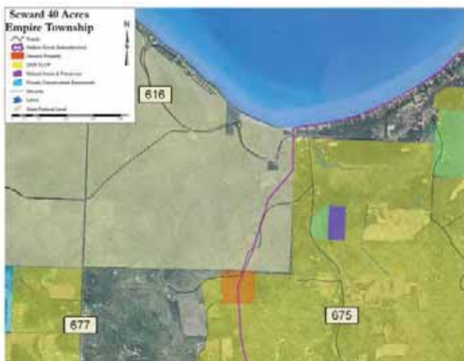
The orange square on the map is the property that is available to a conservation buyer

To view this property and others listed, please visit our website Conservation Buyer page.