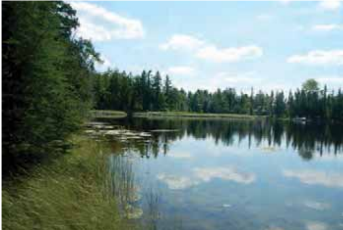
The shores of Brooks Lake, a small lake near Big Glen

Jim and Beverly Duff have six grandchildren between the ages of 8 and 13. One of the things they all like to do when the