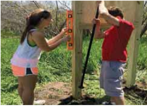
Traverse City West Middle School Greenagers spent the day at DeYoung Natural Area this spring helping to install new kiosks.

We love involving kids in our activities and to expose them to wonders of our natural areas. Conservancy staff and docents have worked with school, scouting, church groups, and families. Here are a few youth-centered activities that happened throughout the year.