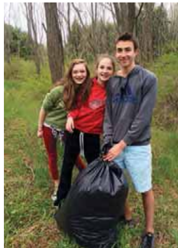
Leland High School students remove invasive garlic mustard from Clay Cliffs Natural Area.