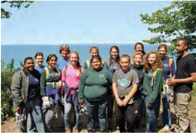
Center for Conservation Leadership students at Clay Cliffs after restoring trails on the property.

Our stewardship team was busy this summer building new trails, getting Clay Cliffs Natural Area ready to open, and removing invasive species.