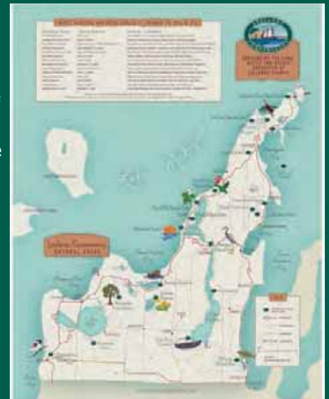
If you did not receive our beautiful Natural Areas map, visit our website Home page (leelanauconservancy.org) and click on the map icon to request a copy.

Now is the best time to give! All gifts made before December 31st (up to $405,000) will be matched dollar for dollar by a group of generous donors.